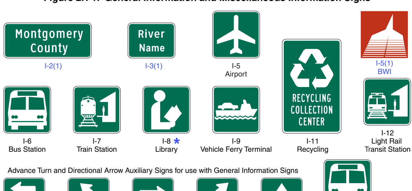
Figure 2H-1. General Information and Miscellaneous Information Signs

If used on freeways or expressways, the Recycling Collection Center symbol sign shall be considered 11 one of the supplemental sign destinations.