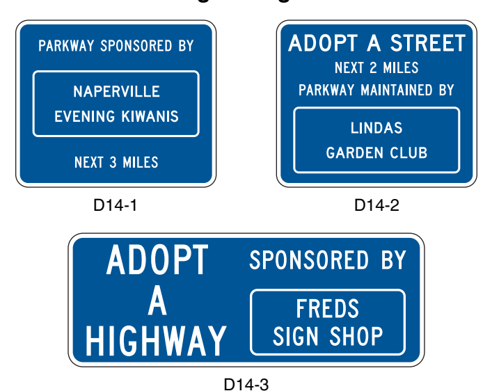
Figure 2H-5. Examples of Acknowledgment Sign Designs

Examples of acknowledgment sign designs are shown in Figure 2H-5.