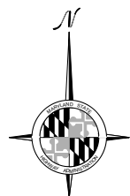
STATEWIDE GRID MAP KEY