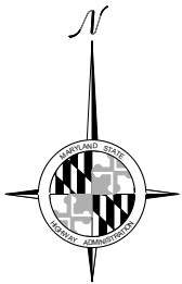
STATEWIDE GRID MAP KEY