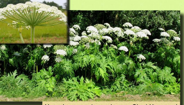
Heracleum mantegazzianum, Giant Hogweed