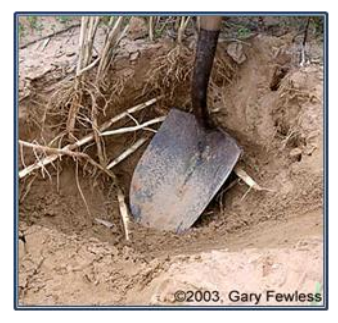
Rhizomes (underground stems)

Reproduction: Phragmites seeds profusely but spreads mostly by rhizomes (underground stems) and is very successful at establishing in disturbed or polluted soils, ditches and dredged areas. Rhizomes can spread up to 30 feet per year. Marsh disturbance from road expansion and shoreline development facilitate growth and expansion of habitat.