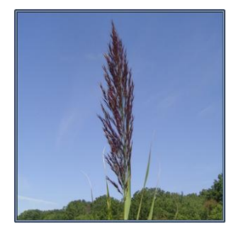
Purple or golden flowers in bushy panicles

Identification: Phragmites is one of the largest marsh grasses and is easily identified by its height. Large fluffy flower heads, or panicles, start out purple or golden and turn gray as seeds form and mature. Leaves are approximately 12 inches long and will turn a golden yellow and drop off after the first frost. Dead stems will remain standing year round.