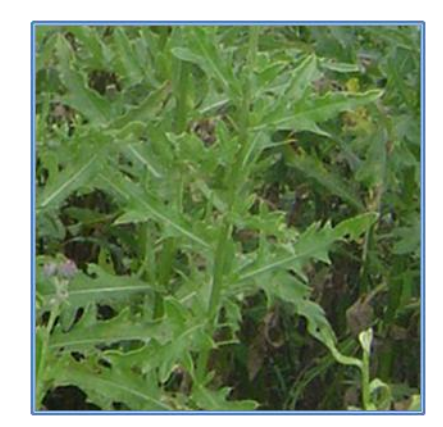
Small purple flowers developing feathery seeds