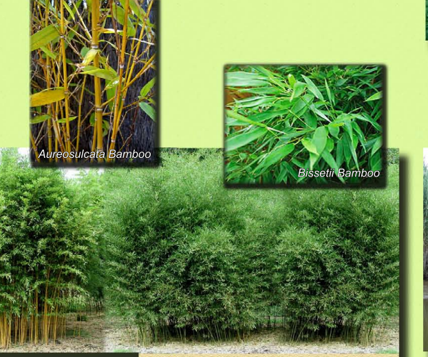
Phyllostachys Sp., Japanese Bamboo