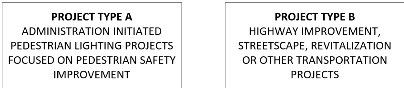
Figure 1: SHA Pedestrian Lighting Policy Project Types

The Financial Responsibility section outlines the respective financial responsibilities for the Administration and Local Jurisdictions for the design, construction, operation and maintenance of