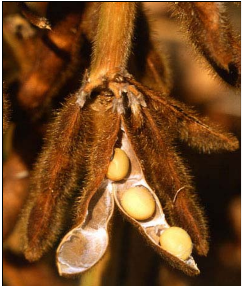
Figure 1 Dried Soybean