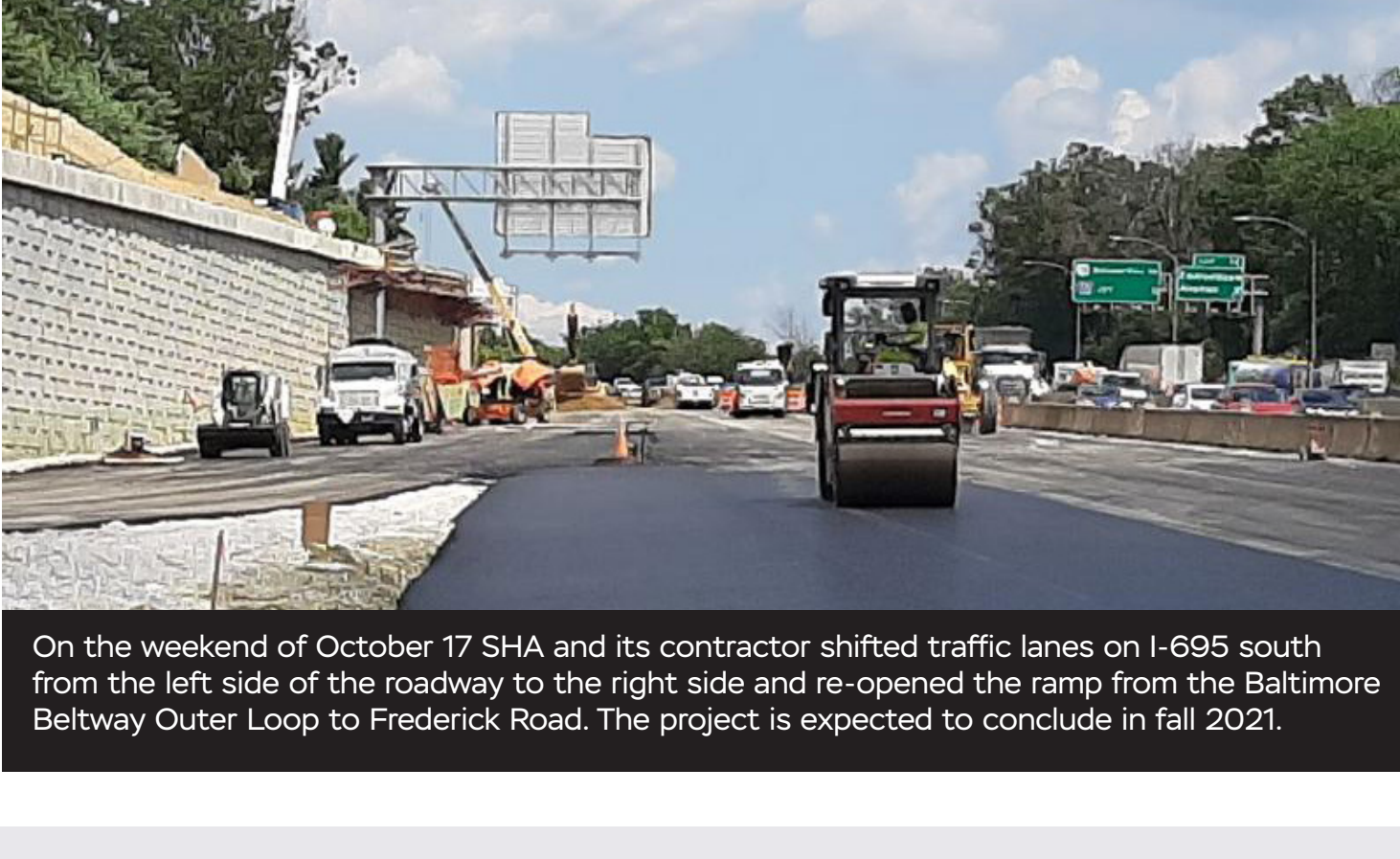
On the weekend of October 17 SHA and its contractor shifted traffic lanes on I-695 south from the left side of the roadway to the right side and re-opened the ramp from the Baltimore Beltway Outer Loop to Frederick Road. The project is expected to conclude in fall 2021.