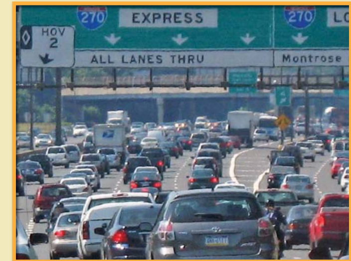
IMPROVING TRAFFIC FLOW