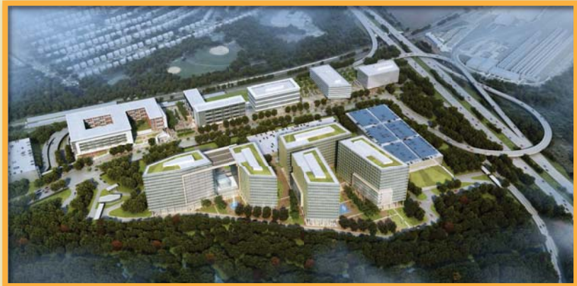
SUPPORTING ECONOMIC DEVELOPMENT