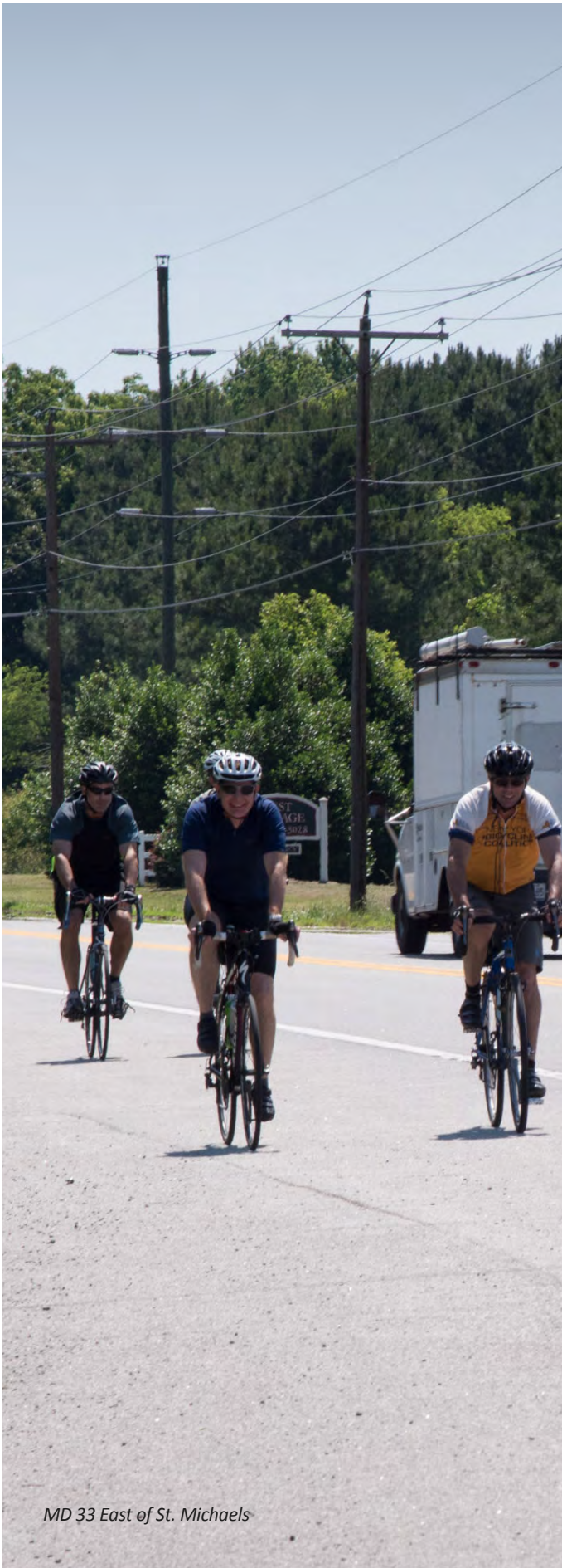
MD 33 East of St. Michaels