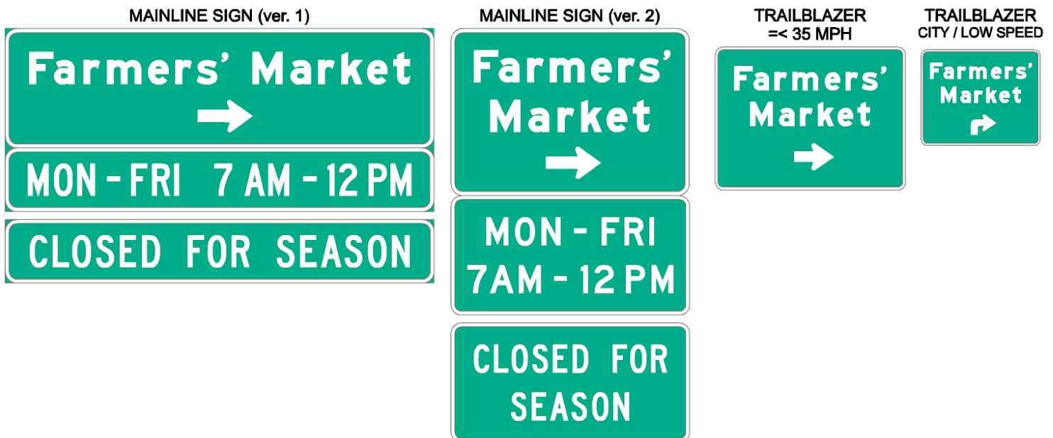
Figure 1 – Farmers' Market Signs

The State Highway Administration's Office of Traffic & Safety has developed the following guidelines for the application, fabrication, installation and maintenance of Farmers' Market highway signs. The Maryland Department of Agriculture and the State Highway Administration have approved a new Farmers' Market highway sign design, shown in Figure 1. They have also established that the costs for new and replacement signs will be borne by the communities and/or organizations which are starting new markets or who are requesting new signs due to location changes, the condition of older signs, or the desire to display the new sign design.