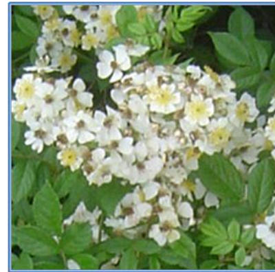
Fragrant, white flowers

Reproduction: Multiflora Rose reproduces by seed as well as by forming new plants where the tips of arching canes touch the ground and form roots. Each plant produces an estimated 1 million seeds per year which remain viable in the soil for up to 20 years.