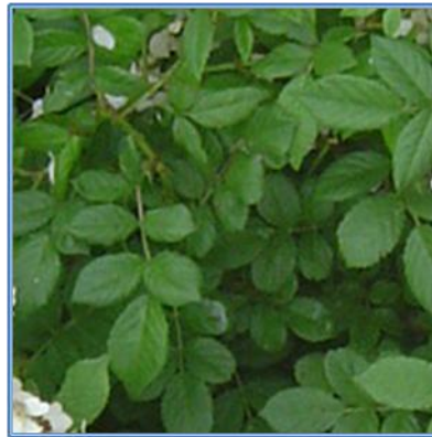
Sharply toothed leaflets

Identification: Leaves are divided into five to 11 sharply toothed leaflets. Leaf stalks have fringed stipules (paired wing-like structures). Clusters of showy, fragrant, white to pinkish flowers bloom in May.