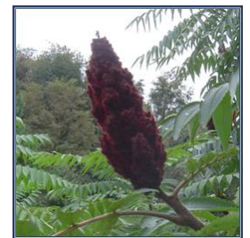
Large, red seed clusters

Reproduction: Tree of Heaven produces large amounts of viable seed. Vigorous resprouting can occur as a result of injury such as breakage or cutting.