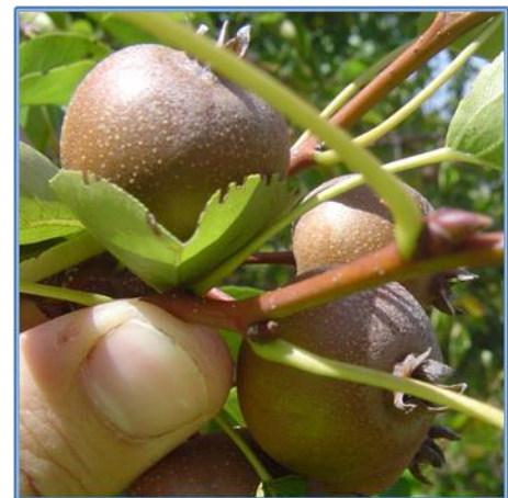
Small, hard, and brown fruits

Reproduction: Callery Pears produce large amounts of seed which is spread by birds and small mammals. Callery pears also develop root sprouts which produce new trees.