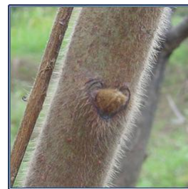
Horseshoe-shaped leaf scar