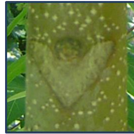
Shield-shaped leaf scar