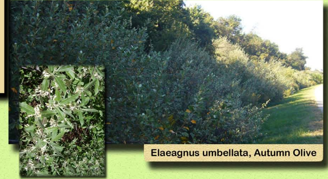
Elaeagnus umbellata , Autumn Olive