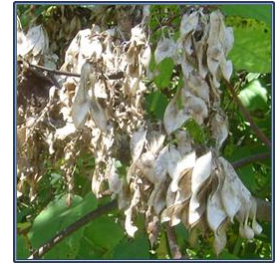
Dry, papery seed clusters