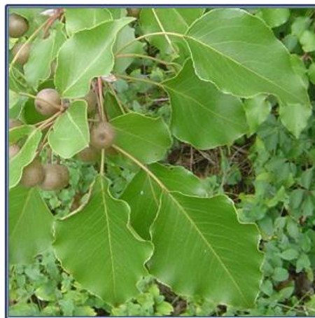
Dark-green, leathery leaves with small round-toothed margins

Identification: Callery Pear reaches 30 to 50 feet high at maturity. Small white flowers bloom in early spring and often appear before the leaves are out. Leaves are 1 ½ to three inches long, shiny, dark-green and leathery with small round-toothed margins. The leaves turn deep red or purple in the fall. Small fruits mature in the fall and are hard, brown, and almost woody. Callery pears have an upright growth habit with tight branching angles, making them susceptible to breaking and splitting.