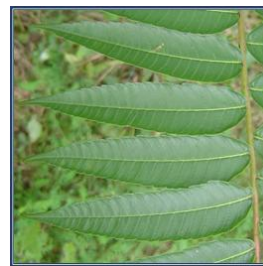
Leaflets with small teeth