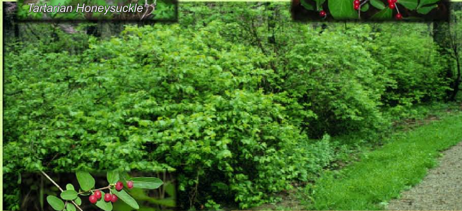
Lonicera sp., Bush Honeysuckles