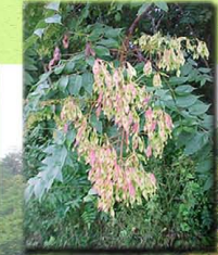
Ailanthus altissima , Tree of Heaven