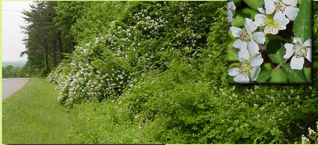
Rosa multiflora , Multiflora Rose