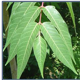
Smooth leaflets with 1 or 2 teeth at base