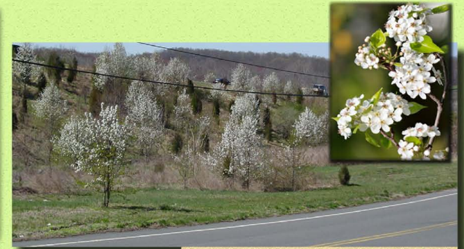
Pyrus calleryana , Callery /Bradford Pear